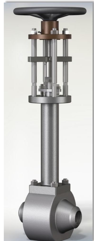
Model 55BS Cryo Globe Valve